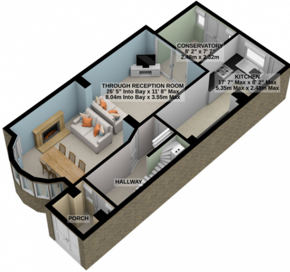
GROUND FLOOR 560 sq.ft. (52.0 sq.m.) approx.