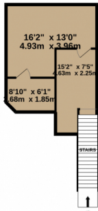
BASEMENT 269 sq ft. (24.3 sq.m.) approx.