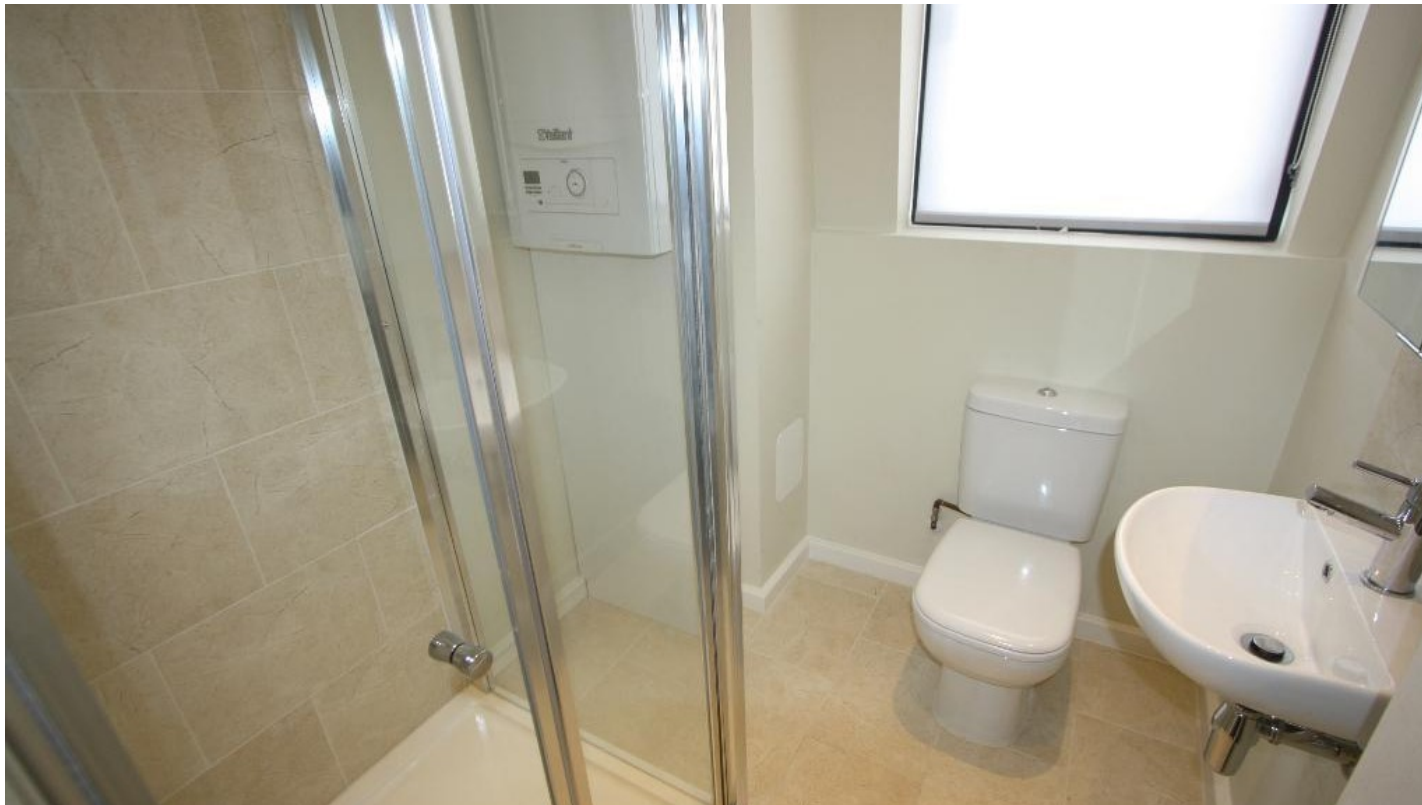
Stunning Duplex Apartment, Modern decor, Sought After Location, Spacious and Bright, Modern Kitchen, Unfurnished, EPC Band C