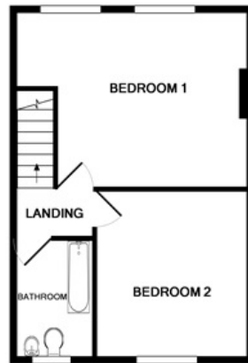
1ST FLOOR APPROX. FLOOR AREA 32.8 SQ.M. (353 SQ.FT.)